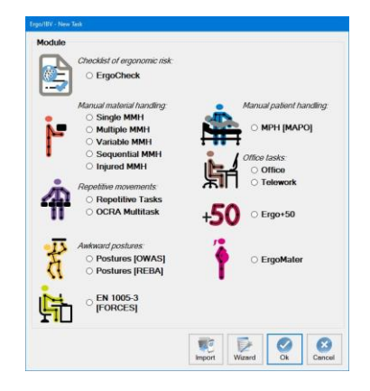
Figure 1. Access to the Injured MMH module

This opens the main window of this module (Figure 2), which shows both the input and the results calculated by the application.